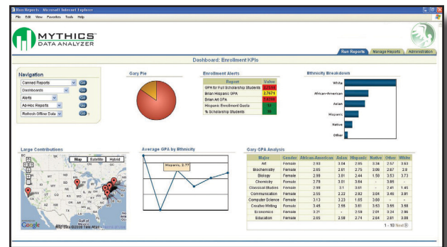
Mythics Data Analyzer dashboard screenshot

For more information contact Mythics at: 1.866.MYTHICS sales@mythics.com www.mythics.com